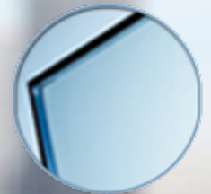
What We See