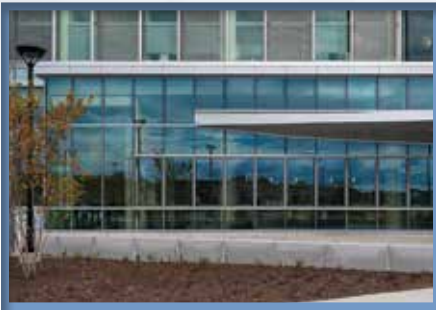
UMASS Science Building, Amherst, MA, USA