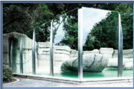
Hellabrunn Zoo, Munich, Germany

A proven bird-friendly glazing treatment, ORNILUX is tested by American Bird Conservancy. The glass has demonstrated to be an effective solution to mitigate bird collisions, especially in areas where transparency is a top priority.